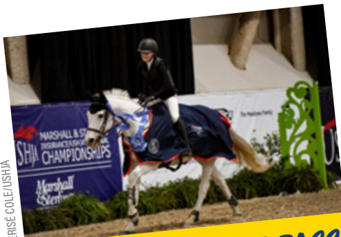
GOLDEN BACKSTAGE PASS